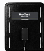
Small antenna* Part No: 824997 (SAP # 880 0000-475)