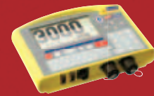
XR3000 Bluetooth® Weigh Scale Indicator