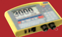
XR3000 Weigh Scale Indicator