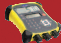
EziWeigh7 Weigh Scale Indicator